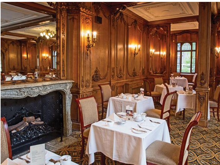
The White Swan Hotel Dining room, Alnwick