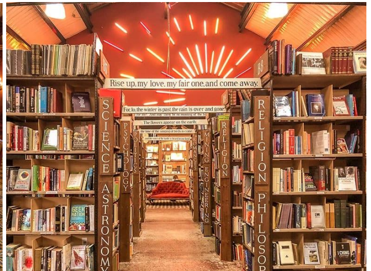
Barter Books, Alnwick